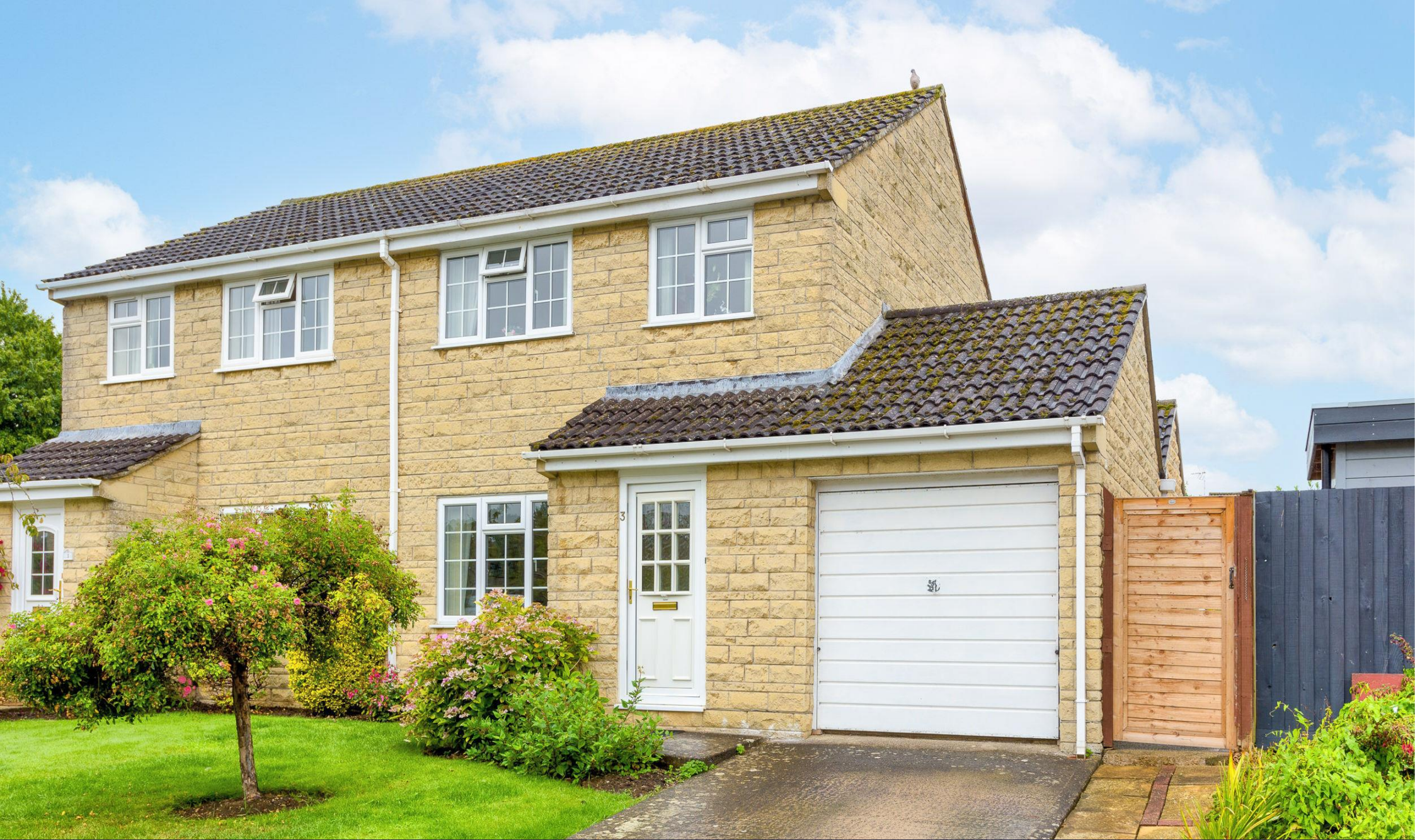
3 Deverell Close Bradford on Avon, Wiltshire, BA15 1UU